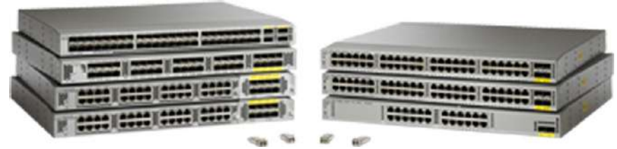
Figure 3. Cisco Nexus 2000 Fabric Extenders