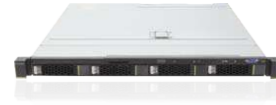
RH1288 V3 (4 hard disks)