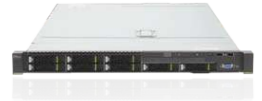
RH1288 V3 (8 hard disks)